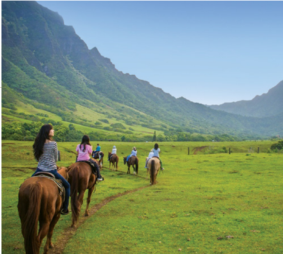
▲ See the spectacular scenery of "Jurassic Valley" on horseback in Kualoa Ranch.

Established in 1850, Kualoa Ranch Private Nature Reserve is owned and managed by eighth generation descendants. Their mission is to enrich people's lives by preserving the sacred lands and celebrating its history. Their vision is to be a role model as stewards of these amazing 4,000 acres.